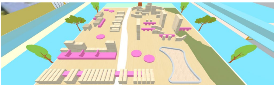
Figure 6. Game III results, which utilised the discrete system. Participants were a bit confused in the beginning with what to do with the parts; however, after some time of trial-and-error, they began to develop an understanding of how to form open or enclosed space from arranging the elements