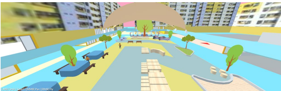
Figure 7. Game IV utilised a mix of modular and discrete KoP systems; in the design process, used open-source platforms to search for proxies that can help demonstrate ideas