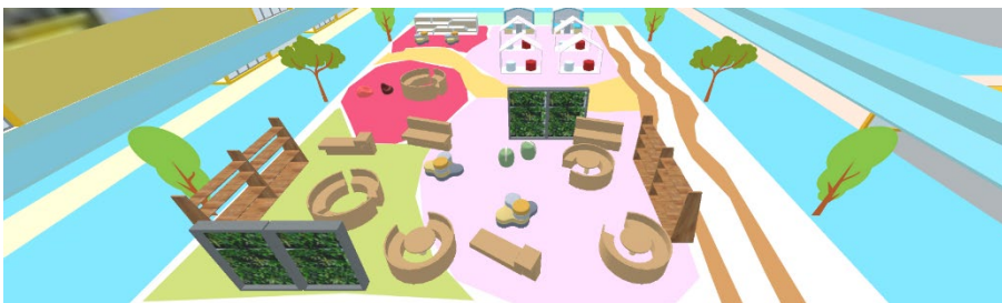
Figure 5. Game II results by participants, which utilised the modular system. The outcome showed participants were more conscious of the density between objects and their orientation