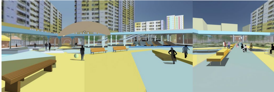
Figure 8. Post-processed Game IV co-creation results, where vegetation, people, and other background details were added to visualise and approximate the implementation of the design

In Game IV, the mixed KoP offered a wider variety of arrangement options for participants, which led them to dive into more diverse architectural configurations, yielding more elaborate and enthralling spatial arrangements (figure 7). Participants first used discrete parts to set apart different areas, resembling a figure-ground exercise; then, replaced some of the elements with modular parts to give variation of spatial quality, accentuating the social areas. The outcome comprised four distinct activity scenarios assembled into a public space design, each tailored to facilitate a community-building activity - a playground with a sandbox, a circular gathering space, a covered skill-building area with tables and chairs, and a lunch spot under the trees. The spatial quality of the outcome showed improvement, with more awareness towards density between objects and their orientation, resulting in interesting in-between spaces and facility arrangements. However, there were specific parts, like the tensile structure that spanned across the entire courtyard, that the participants wanted but not in the kit. As a result, designers had to 3D model those parts on the spot. Open-source platforms were also used to search for additional 3D assets that can help demonstrate the idea.