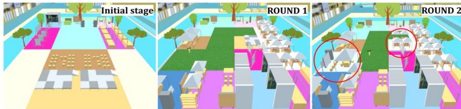
Figure 4. Game I by participants, which utilised the modular-integrated system. As each module represented 5% of total land area, the creative process became a game of numbers