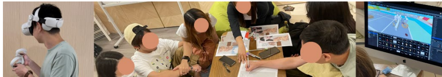
Figure 2. Participants discussing and arranging KoP in the virtual sandbox during game 2

respectively using modular-integrated, modular and discrete parts, and 3) tested in the game with end-users to study the combinatorial creativity generated in the process.